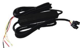
Led Flash Controller