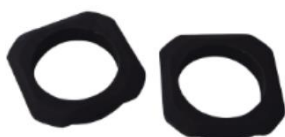
2 Mounting Grommets